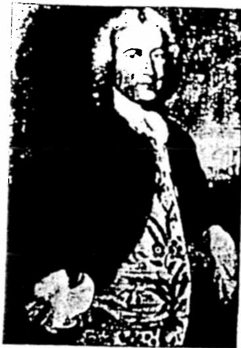
With public sentiment running high against the British, Patriot John Adams led the defense team for the British soldiers accused of murder in the Boston Massacre.

To Sam Adams and the other Sons of Liberty, Capt. Preston's acquittal was disturbing, but not entirely